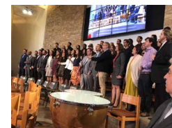
Alumni medical students sing praises to God.

The hard work of the 16 graduates of the Adventist University of the Philippines College of Medicine (AUPCOM) culminated in their receiving their MD degrees in June 2019. They constituted the first fruits of this fledgling School of Medicine, and named their class Prima Lux 2019 (the first light of the day is so special and the context very meaningful). Families, graduates, administrators, teachers, and guests celebrated the excellent accomplishments of this diverse and talented class. The class formed an acclaimed choir during their student years and it was inspiring to hear them sing at their commitment ceremony. We pray they will be richly blessed as they extend the reach of Comprehensive Health Ministry in the Philippines and the various countries they will serve. Soli Deo Gloria – to God be the glory.