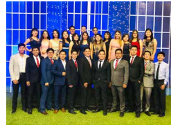
Medical students at their graduation.