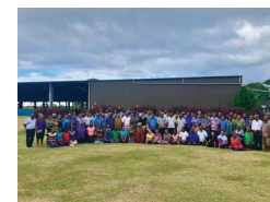
The Solomon Islands ARMin training participants poses for a picture.