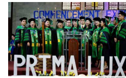
Singing graduates perform during graduation weekend.