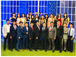
Medical students at their graduation.