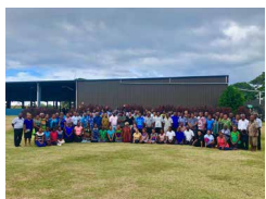
The Solomon Islands ARMin training participants poses for a picture.