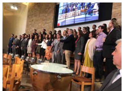
Alumni medical students sing praises to God.

The hard work of the 16 graduates of the Adventist University of the Philippines College of Medicine (AUPCOM) culminated in their receiving their MD degrees in June 2019. They constituted the first fruits of this fledgling School of Medicine, and named their class Prima Lux 2019 (the first light of the day is so special and the context very meaningful). Families, graduates, administrators, teachers, and guests celebrated the excellent accomplishments of this diverse and talented class. The class formed an acclaimed choir during their student years and it was inspiring to hear them sing at their commitment ceremony. We pray they will be richly blessed as they extend the reach of Comprehensive Health Ministry in the Philippines and the various countries they will serve. Soli Deo Gloria – to God be the glory.