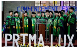
Singing graduates perform during graduation weekend.