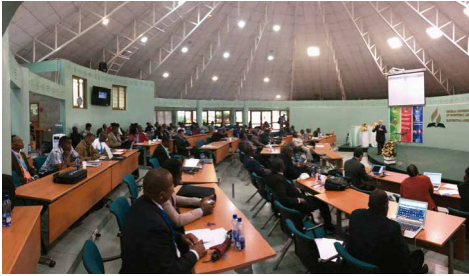
Participants of the AAIM Congress