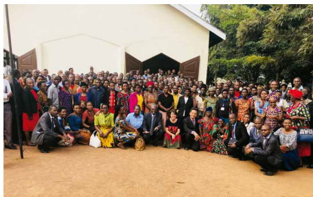
Participants of the Northern Tanzania Union CHM Training.