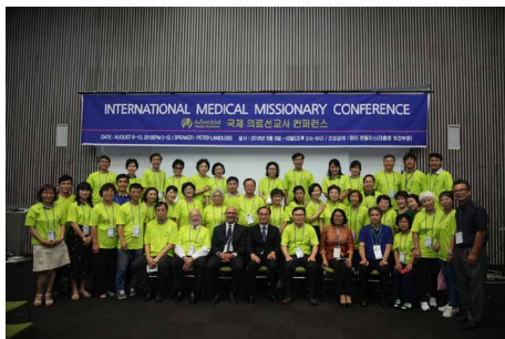
International Mission Congress attendees