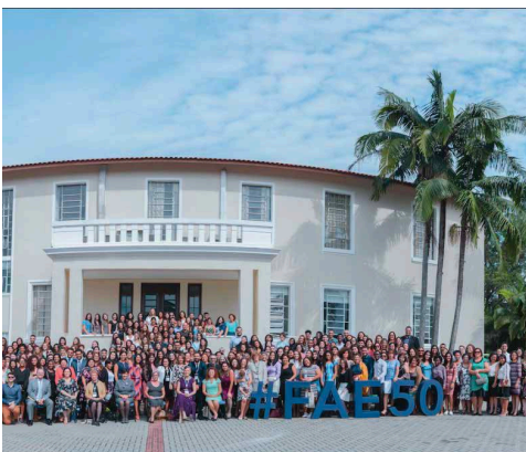
Faculty, students and alumni nurses join for a picture.