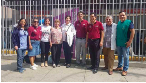
Theological Seminary Faculty and Health Professionals joined at the Health Expo effort in Lima.