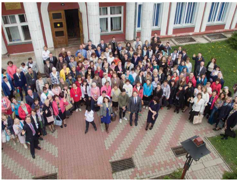
Participants pose for a picture.