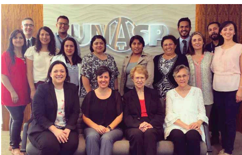
AINEC-LA members attending its 5th meeting in Brazil.