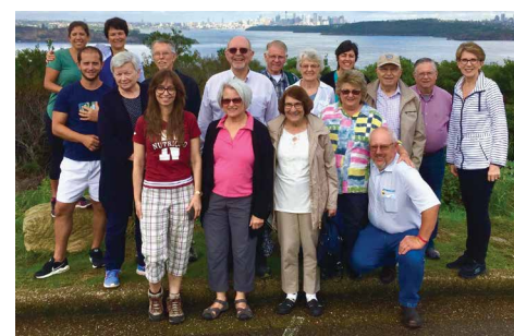
GCNC members and spouses near Sydney, Australia.