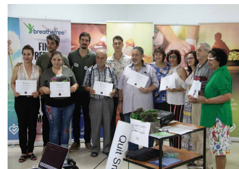
Non-Smoking graduates and facilitators.