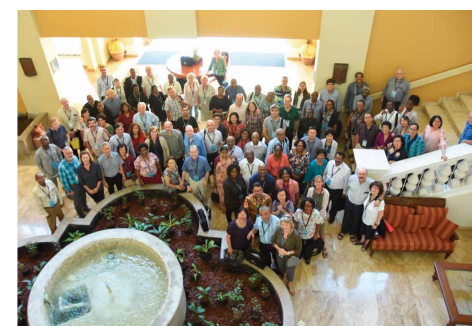
Participants of GC Global Leadership Conference.

Montego Bay, Jamaica | General Conference On February 1-10, 2019, Adventist church world leaders gathered in Montego-Bay, Jamaica, for their annual leadership conference. This time a major focus of the meeting was on comprehensive health ministry and personal health. Nearly 200 attendees and their spouses representing 13 divisions and Israel field were offered health screening tests before and after the week-long conference. Presentations and group discussion covered various whole health topics each morning, as well as in depth workshop seminars which focused on cardiovascular health, weight management, mental health, nutrition and diabetes. Attendees were offered a total vegetarian diet and encouraged to rest, engage in physical activity daily in the sunshine. At the end of the week they were counseled on their lab results and many had not only lost weight but were happily surprised to learn that their blood pressure and/or cholesterol levels were lower. They left the conference committed not only to implement the principles of health in their life but also to bring a message of healing and hope to the cities using comprehensive health ministry.