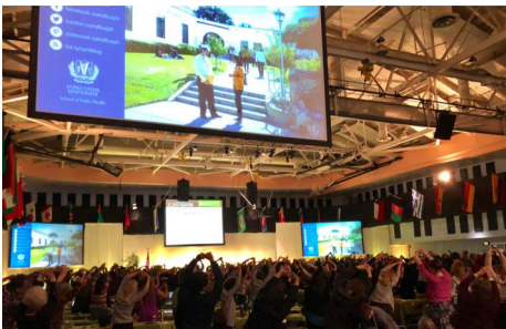
Attendees take a break to stretch and move during the Congress.

On March 13-15 the South American Division (SAD) held its first Health Ministries Advisory, bringing together Union Health Directors, medical directors of several hospitals and other important collaborators representing eight countries and territories. The GC Health Ministries team shared messages of inspiration and relevant content to equip the leaders in comprehensive health ministry (CHM). The 3-day advisory took place in Brasilia at the SAD headquarters and focuses on a balanced CHM and its mission. Many resources were discussed as well as a strategies for discipleship. Following the Advisory, an Adventist Recovery Ministries (ARMin) Global training was conducted from March 16-18 and dozens of local church leaders and health professionals joined in to become facilitators of 12-step recovery groups in their communities. The group left motivated to share Jesus healing ministry in vibrant and effective ways.