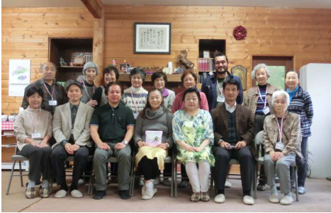
Attendees of the NEWSTART program in Tonegun Minakami City, Japan.