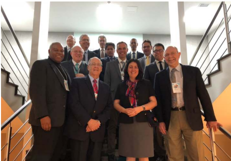
Participants of the SAD HM advisory and ARMin Global training in Brasilia.